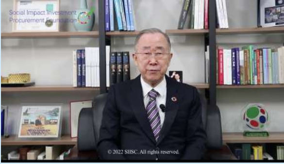
BAN Ki-moon, Former Secretary-General of the United Nations

Collaborative Action is Key to Achieving the Global Sustainable Development Goals (SDGs)