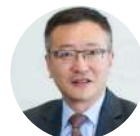
FANG Ke Director General of Implementation Monitoring Department, Asian Infrastructure Investment Bank (AIIB)