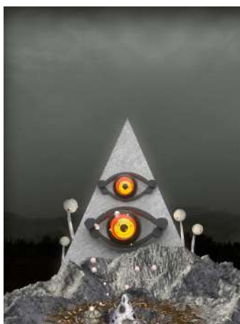
Acid Metaverse Planet colony