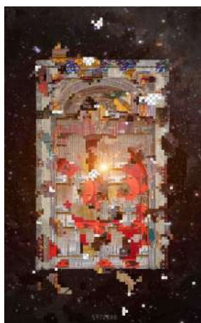
Digital Babel Library: Little Gate

Member of Shanghai Artists Association. His works have been collected by National Art Museum of China, Shanghai Art Museum, and exhibited abroad in France, Germany, Austria, Switzerland, Poland, etc.